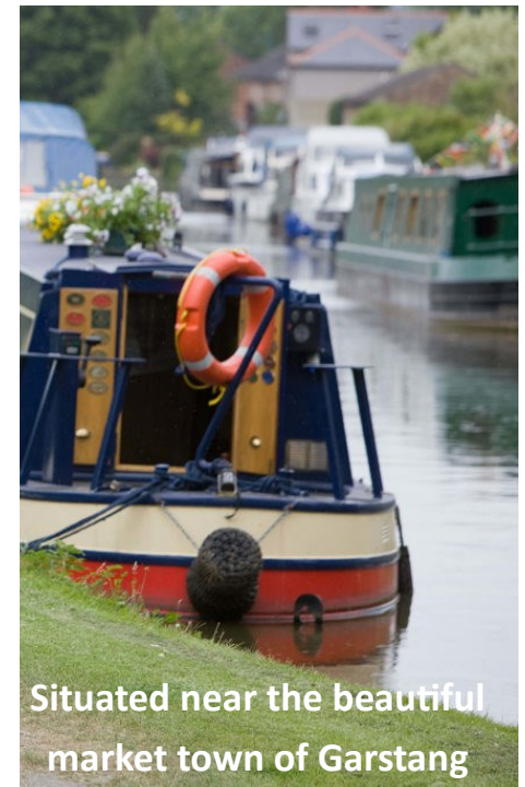
Situated near the beautiful market town of Garstang